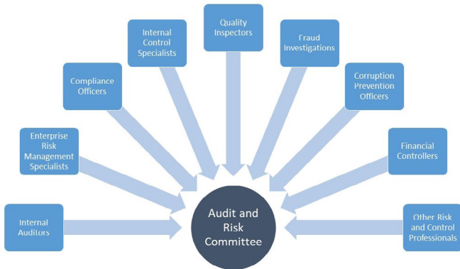
Exhibit 4 – Inputs for Forming an Overall Opinion on the Entity's Security Culture